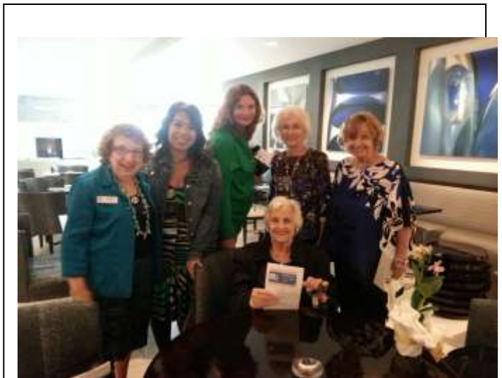
AAUW Funds Committee Carpooling to the Luncheon.