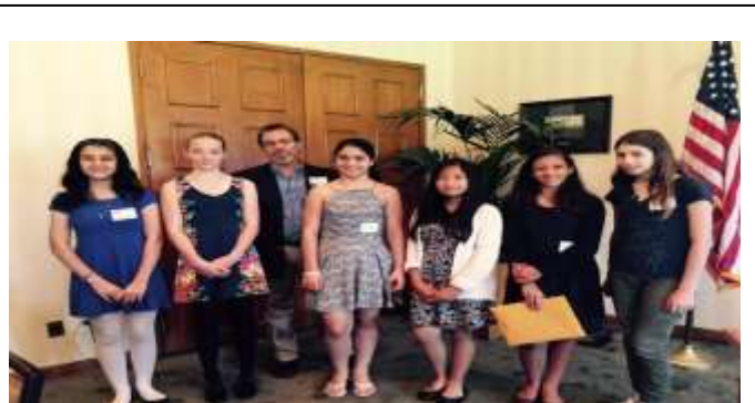
Teck Trek Campers